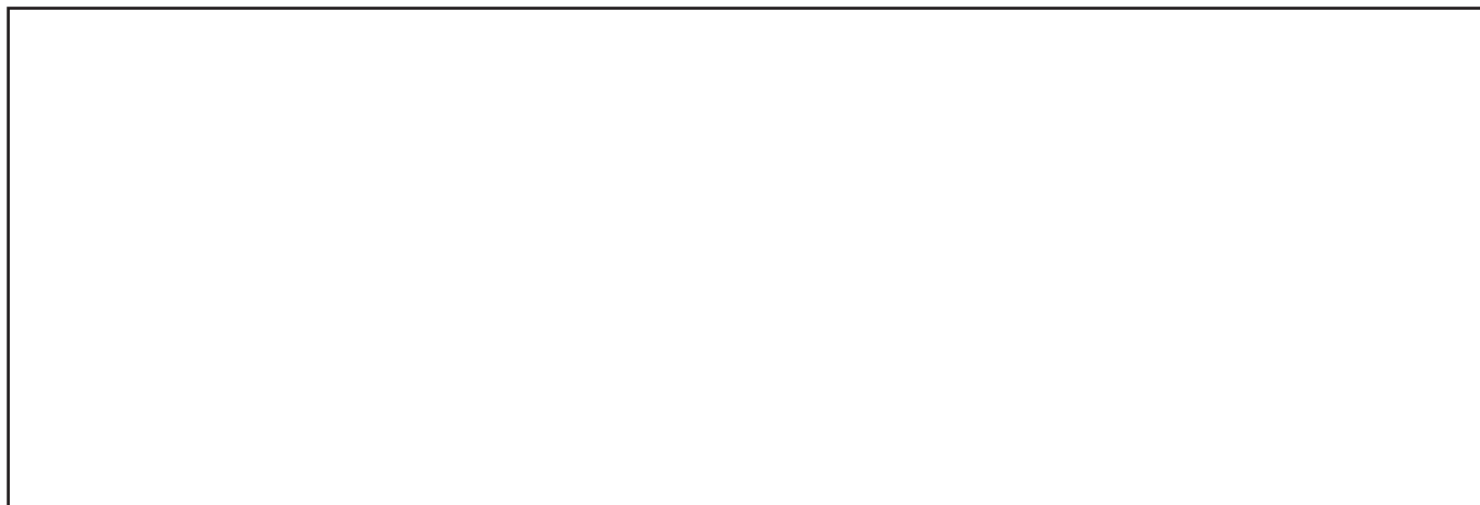
Figure 7.3 - Route of Longshore Drift (Annotated Diagram)

Wind Direction: _____ Wind Speed: _____ m/s Direction of Longshore Drift : From _____ to _____ Horizontal displacement of Longshore Drift: _____ cm